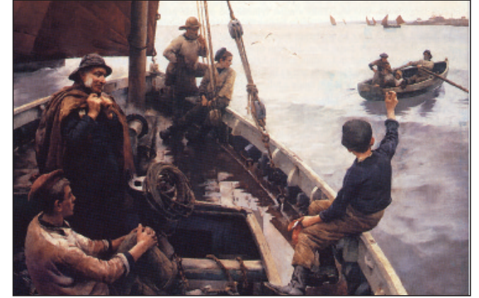
Off to the Fishing Grounds, 1886, STANHOPE FORBES