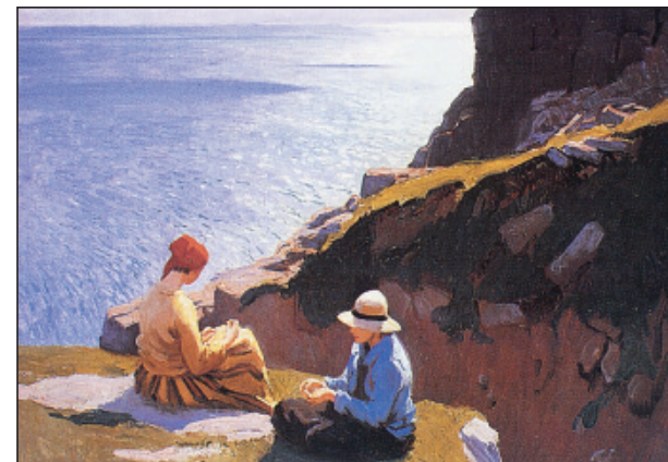
On the Cliffs, 1917, LAURA KNIGHT