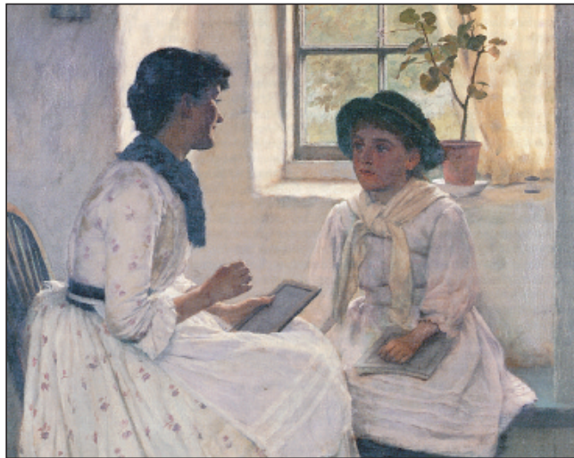
The Lesson, 1889, EDWIN HARRIS